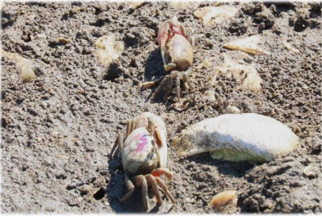
Sand Fiddler Crab Leptuca pugilator