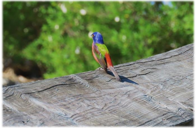
Painted Bunting Passerina ciris