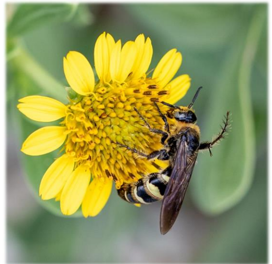
Feather-legged Scoliid Wasp Dielis plumipes