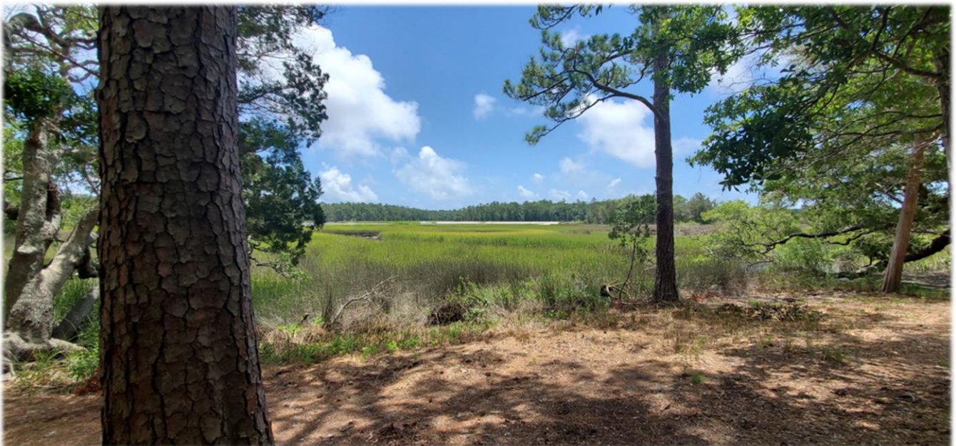
A view of the marshes along the intracoastal waterway.