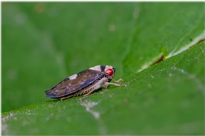
Leafhopper Eutettix pictus