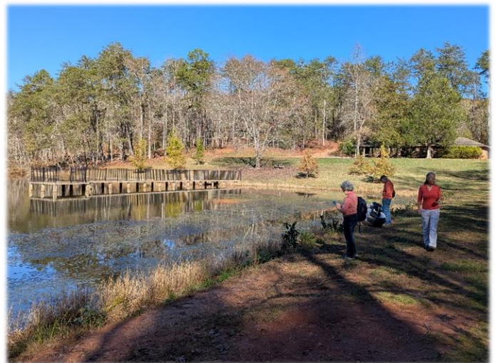
SCANNing the mill pond for signs of life.