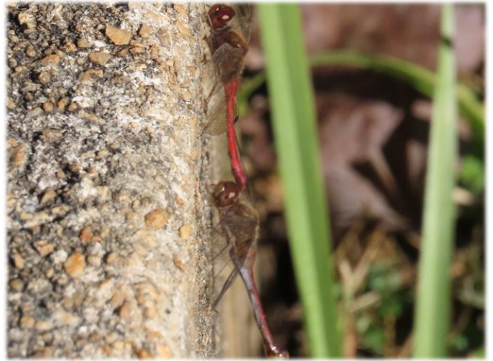
A pair of Autumn Meadowhawks Sympetrum vicinum