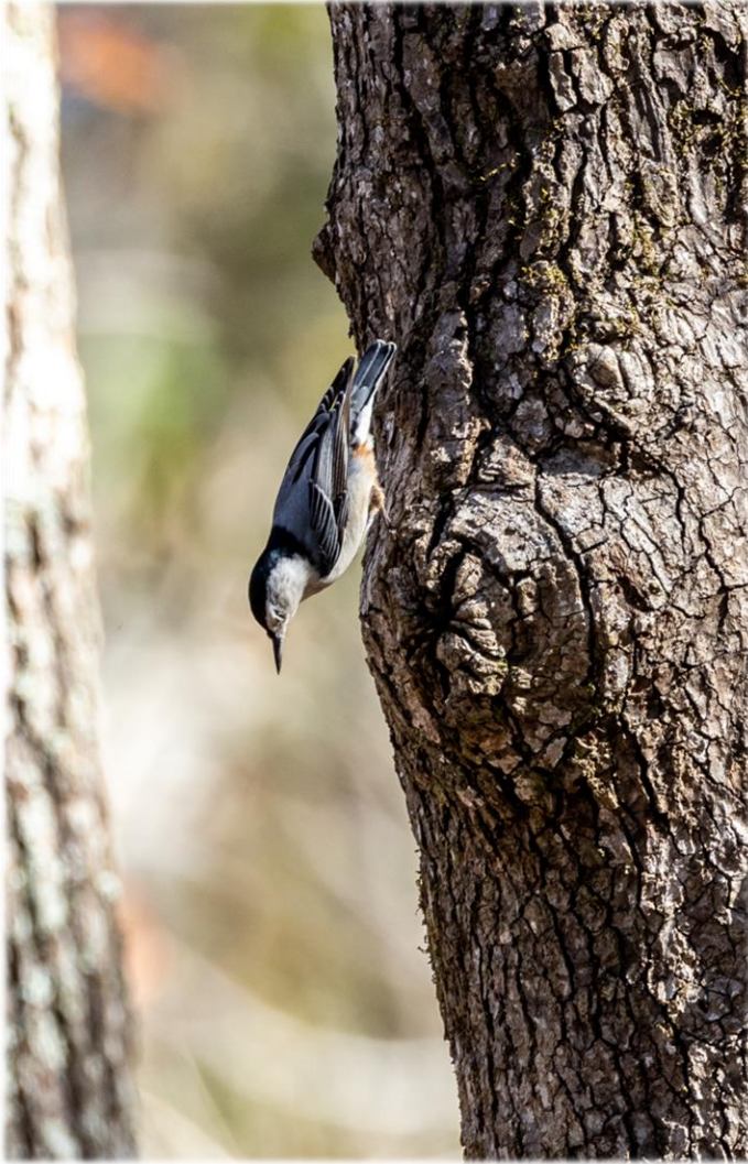
White-breasted Nuthatch Sitta carolinensis