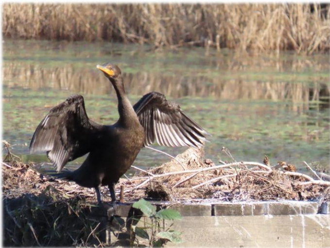
Double-crested Cormorant Nannopterum auritum