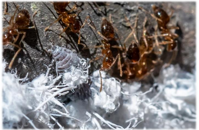
American Winter Ants ( Prenolepis imparis) tending to Woolly Alder Aphids ( Prociphilus tessellatus).