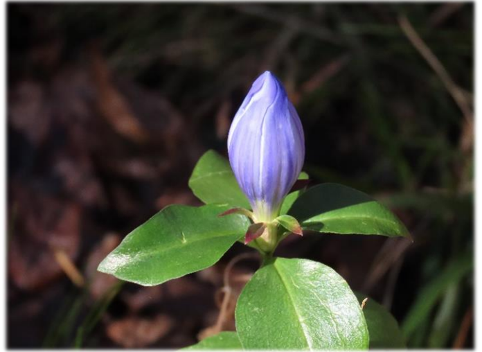
Soapwort Gentian Gentiana saponaria