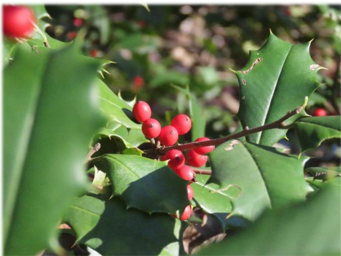
American Holly Ilex opaca