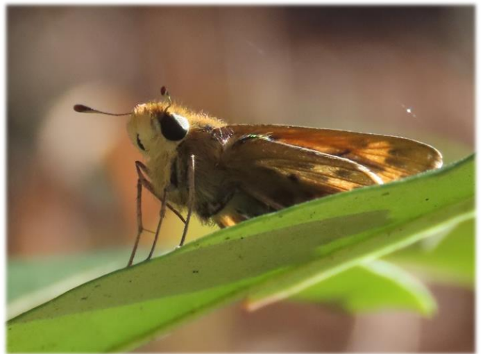
Fiery Skipper Hylephila phyleus