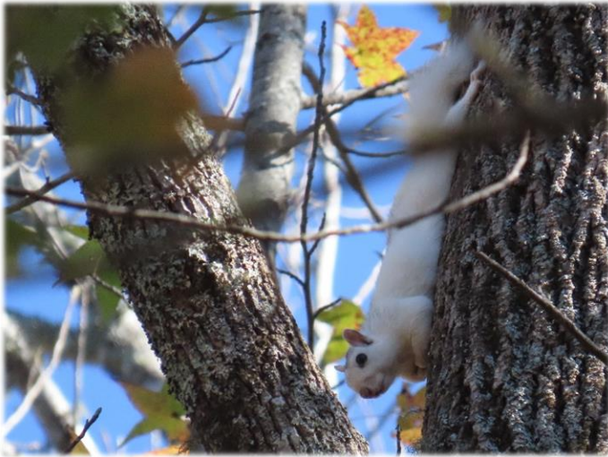
Call me Ishmael! The great white squirrel of Pleasant Ridge. Eastern Gray Squirrel Sciurus carolinensis