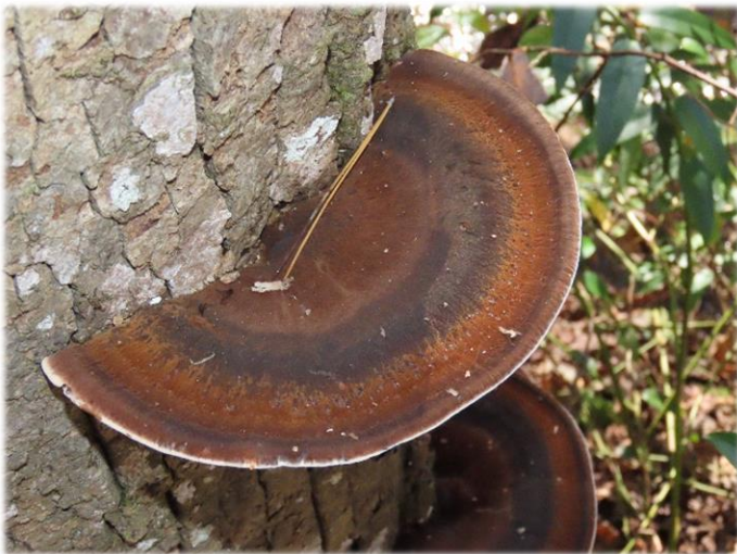
Resinous Polypore Ischnoderma resinosum