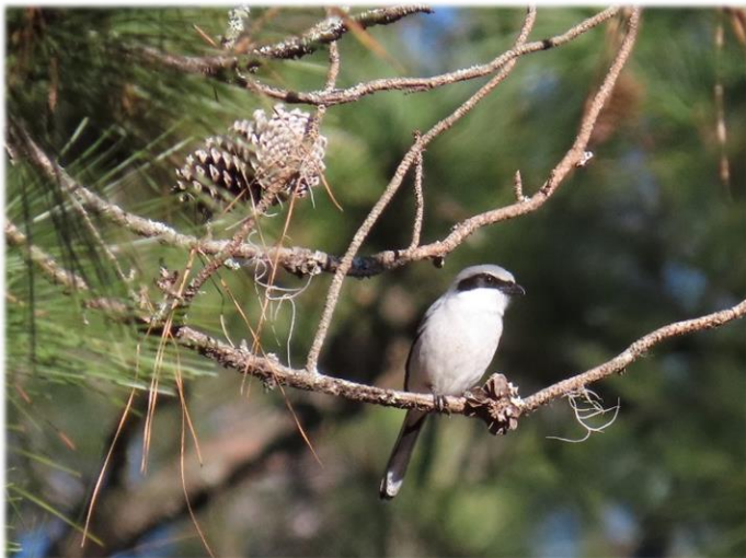
Loggerhead Shrike ( Lanius ludovicianus )