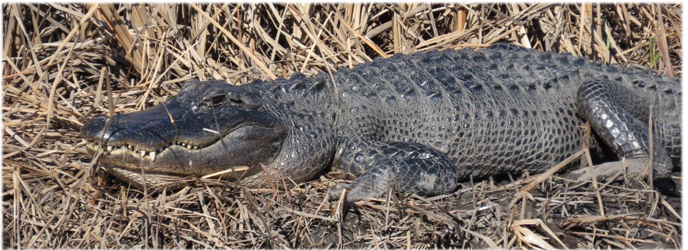
American Alligator ( Alligator mississippiensis ) sunbathing in the rice field.