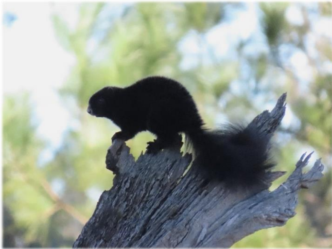
Southern Fox Squirrel ( Sciurus niger niger )