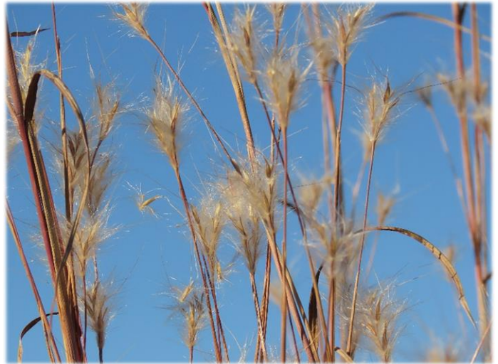
Splitbeard Bluestem ( Andropogon ternarius )