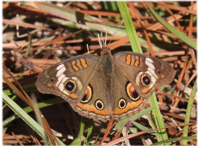
Common Buckeye ( Junonia coenia )