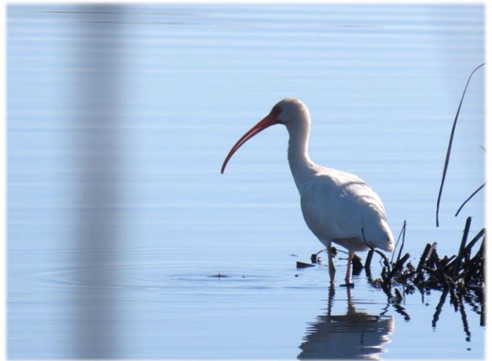
White Ibis ( Eudocimus albus )