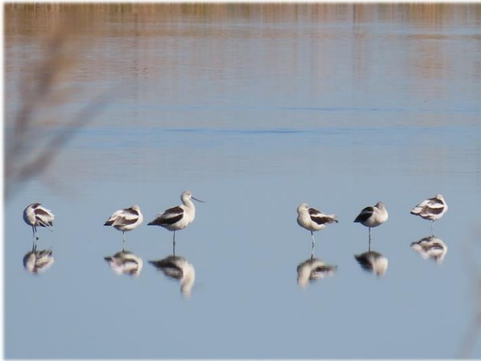
American Avocets ( Recurvirostra americana )