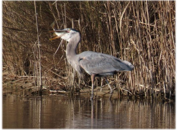
Great Blue Heron ( Ardea herodias ) gulping down a Weakfish ( Cynoscion regalis )