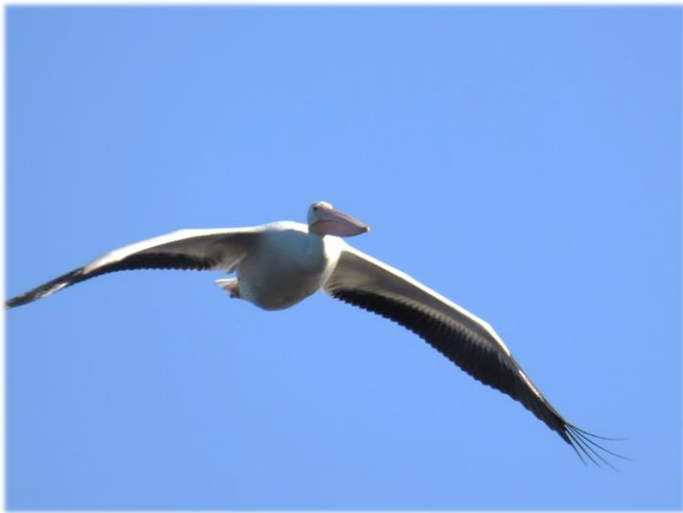
American White Pelican ( Pelecanus erythrorhynchos )