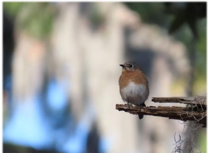
Eastern Bluebird ( Sialia sialis )