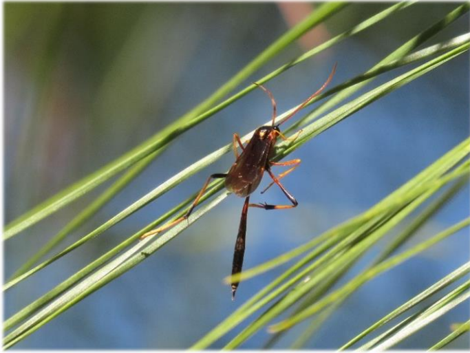
A species of Therion wasp.