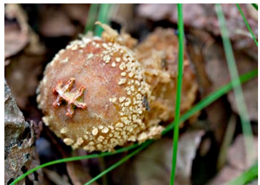
Stalked puffball-in-aspic ( Calostoma cinnabarina )